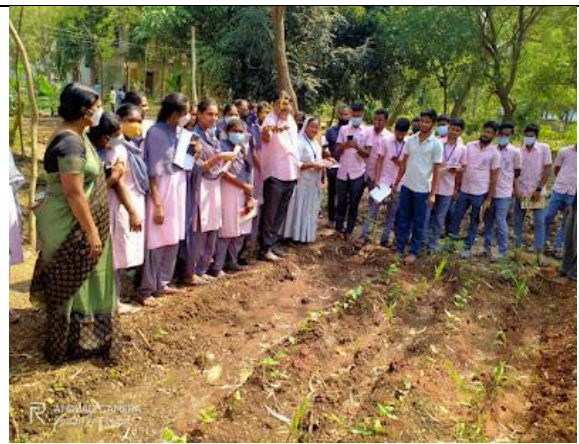
Department of Botany organized an Institutional Visit to Medicinal plants Expo on 30 th March.