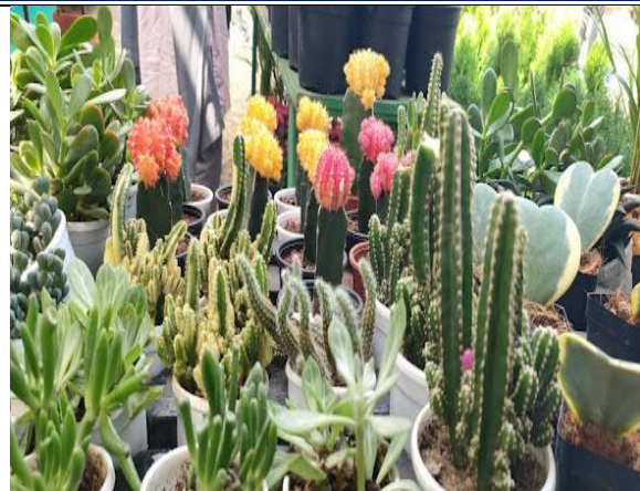
The Department of Botany organized a Field Visit on 10 th March, 2022.